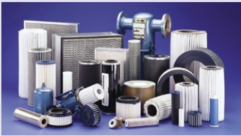
Standard Filter Product