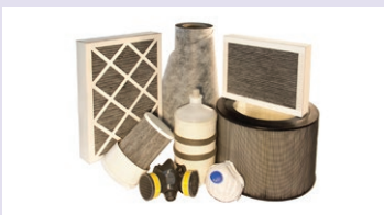
PLEKX Composite Web Media