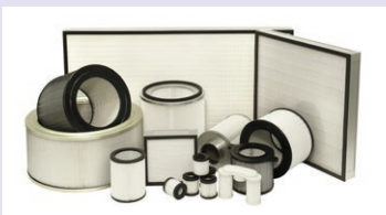
HEPAfine & ULPAfine