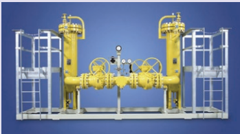
Engineered Filtration Equipment